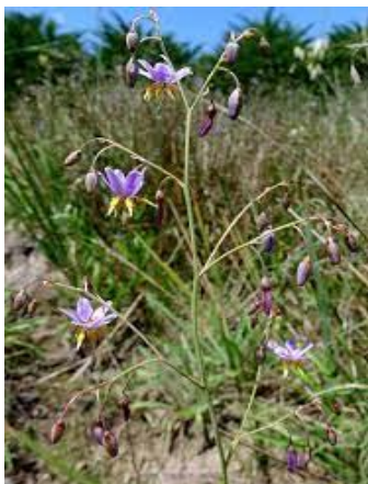
Matted Flax Lily

We were fortunate to be able to hold two tours of Nangak Tamboree in November led by Wurundjeri Woi-wurrung elder Dave Wandin who arranged a smoking ceremony and to welcome to country. The participants took in the results of work done healing country e.g., burning and the construction of an ephemeral wetland