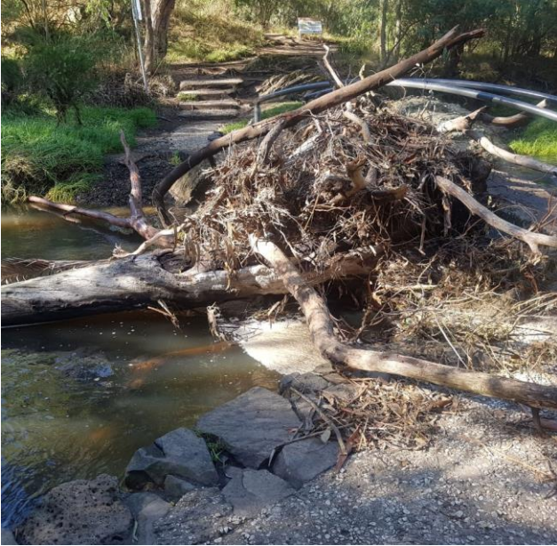
Red gum in the creek

You might already have gathered that Darebin Parklands is a turtle hotspot at but our Monash University turtle researchers set two traps in the Duck Pond and wetland 2 (base of the spillway) for just one night and caught 128 eastern longneck turtles. Mind boggling numbers! Not only did we build a water treatment system, but it appears a turtle sanctuary as well.