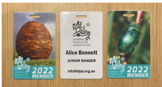
Sample membership cards

We'll provide you with further information regarding collection of the 2022 membership cards as soon as we're able to.