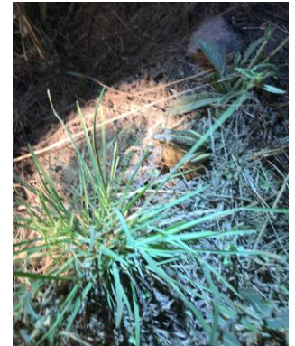
Growling Grass Frogs at Hanson Quarry in Wollert